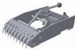
LION bacon gripper hook.