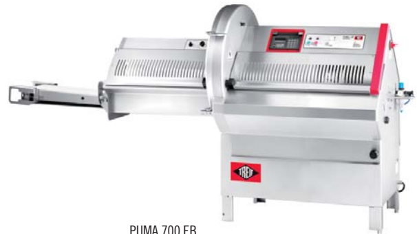
PUMA 700 EB

The machine slices products at temperatures as cold as -4\text{ }^{\circ}\text{C}/24.8\text{ }^{\circ}\text{F} .